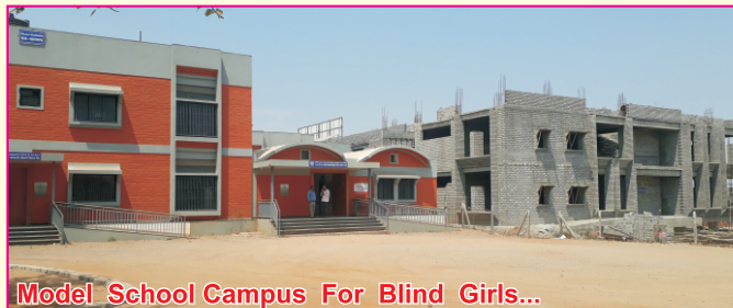
Model School Campus For Blind Girls...

This school is situated at Alandi Devachi, Dist. Pune. More than 125 students benefit from this institution at any given point of time with a special focus on admissions to rural visually impaired girl children. The NFBM Jagriti