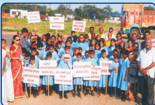
Girls of Jagriti School with slogan boards for public awareness on the occasion of White Cane Day.