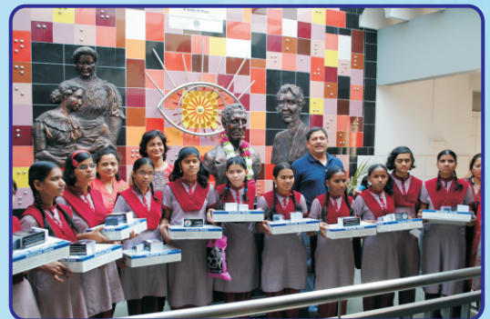
The Students appeared for SSC Examination of Maharashtra Board with their gifts received on the occasion of Send-off program