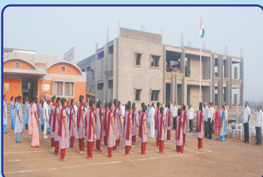
All Students, Staffs, Office bearers, Committee Members, Parents/Guardian and other dignitaries at the ceremony flag hoisting of Republic Day