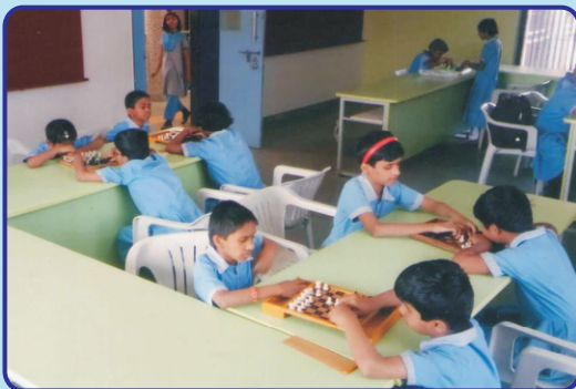
Visually Girls playing Chess during a intra school chess competition