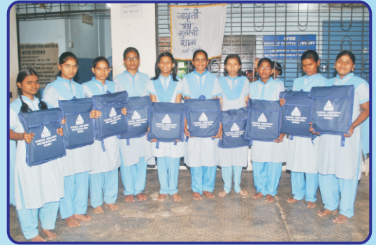
A group of our highschool students with Special School kits sponsored by NAB India