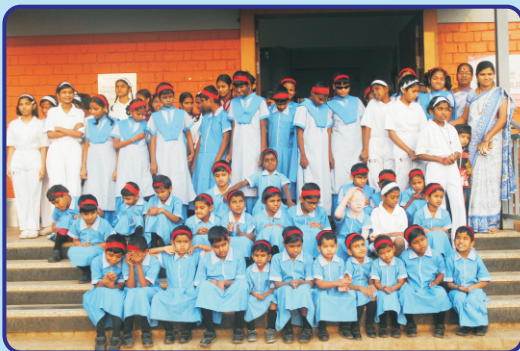
The Students of NFBM Jagriti School for Blind Girls