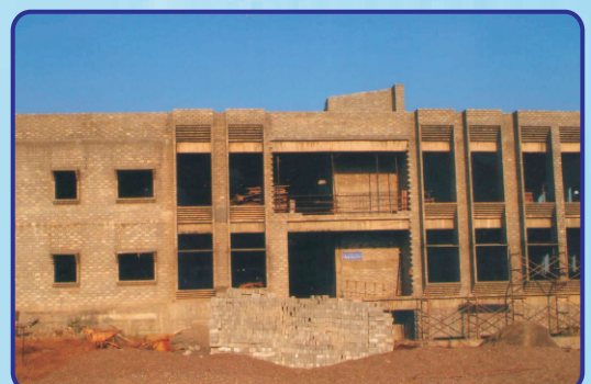
A snap of work in progress of Hostel Building in Career Oriented Education Campus for the Blind (COECB), At Charholi, Pune