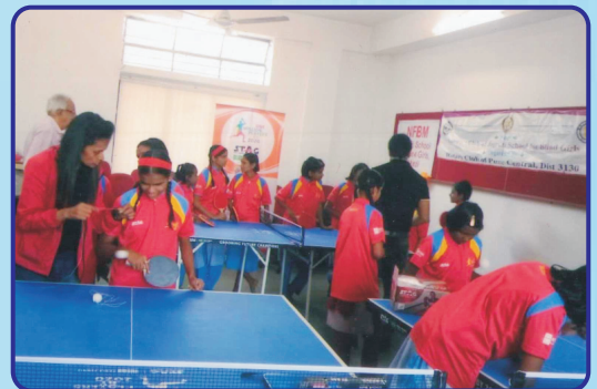
Our Students during training session of Table Tennis Game