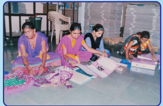
Visually impaired trainees at practical training session of files making Project at NFBM Vocational Training Centre, at Aurangabad.