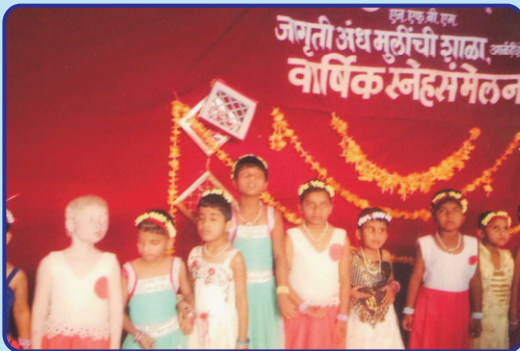
Students of Jagriti School for Blind Girls, Pune at Annual Gathering & performing a dance