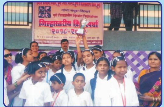
Victorious Team of Jagriti School with Winner Trophy for best performance in a District Level Sport Meet organised by Pune Jilha Parishad, Pune