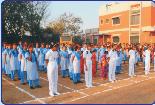
Students in the rows on the occasion of flag hoisting of Indian Independence Day