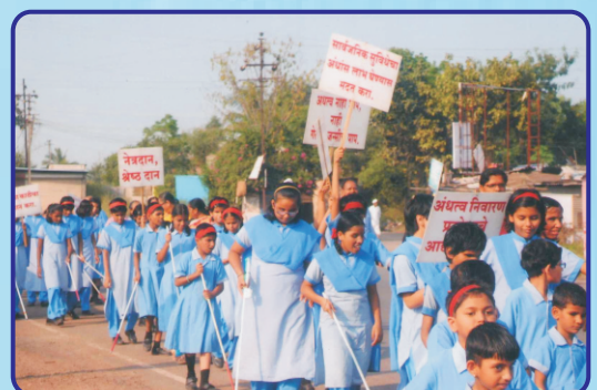
The students of Jagriti School with slogan boards in a long march taken out for public awareness on the occasion of White Cane Day.