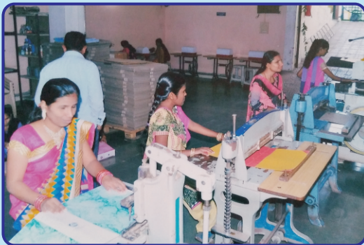
Visually impaired trainees at practical training session of files making Project at NFBM Vocational Training Centre, at Aurangabad.