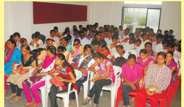
The visually impaired participants from all over Maharashtra were gathered for Youth Festival-2017