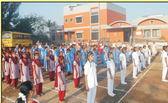
The Students of Jagriti School on the occasion of Republic Day flag hoisting