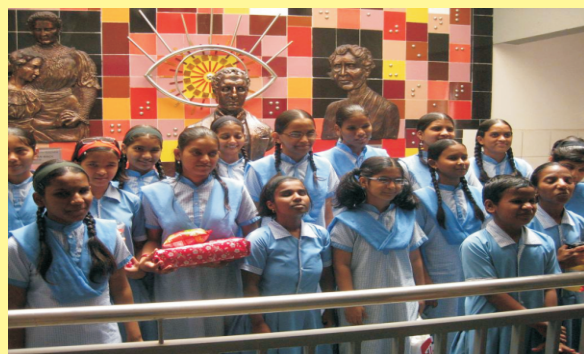
The students appeared for SSC Examination with their gifts given to them on the occasion of Send-off program.