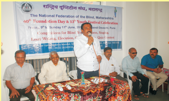
Hon. Nitin Kalaje, Mayor of Pimpri-Chinchwad Corporation addressed on the occasion of Inaugural event of Youth Festival