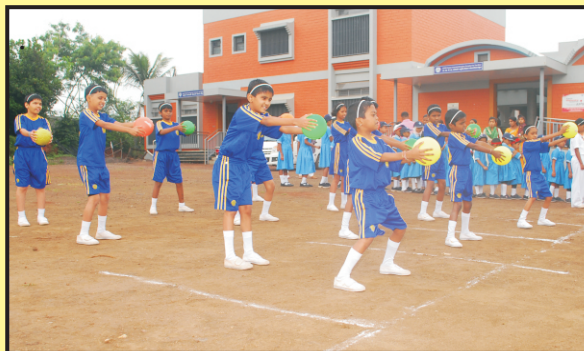
The students of Jagriti school in mood of a sport activity