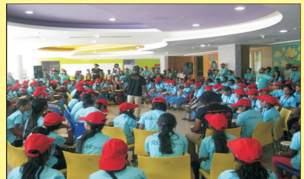
Students of Jagriti School have visited to Tech Mahindra Makers Lab as an activity in Summer Camp 2017