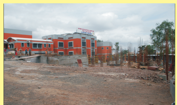
A snap of Career Oriented Education Campus for the Blind... can see construction of Phase-2 of Hostel Building is in progress