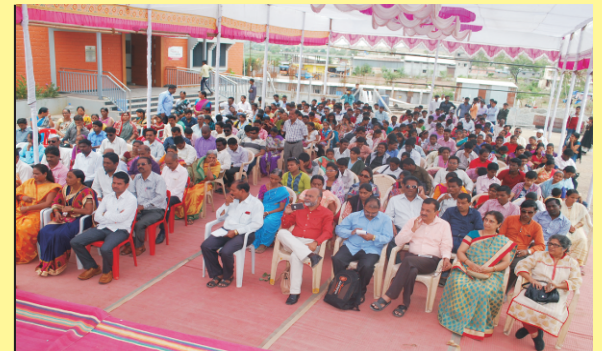
The visually impaired members from all over Maharashtra gathered for 40th Foundation Day function of NFBM