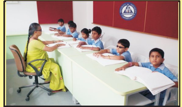
The students are engrossed in reading Braille book in a classroom of Jagriti School for Blind Girls, Alandi, Pune